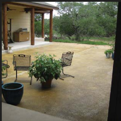
Description: Color: Bronze Texture: Salt Rock