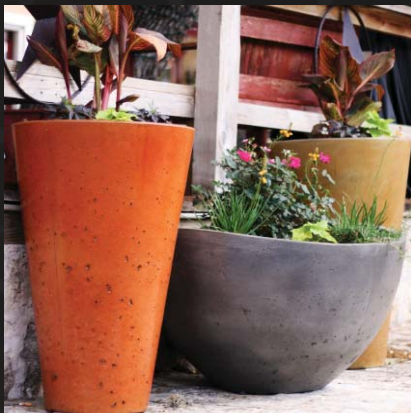
Landscape Basins and Fire Bowls