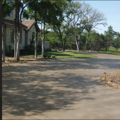
Description: Color: Mahogany Texture: Salt Rock