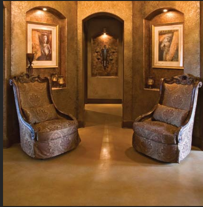
Interior Residential Stained and Sealed Concrete Flooring