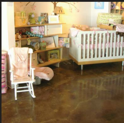
Description: Color: Mahogany