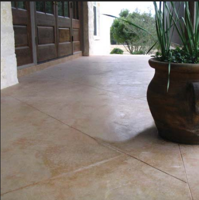
Description: Color: Golden Wheat Texture: Troweled