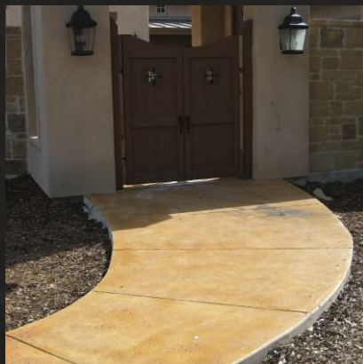
Description: Color: Golden Wheat Texture: Salt Rock