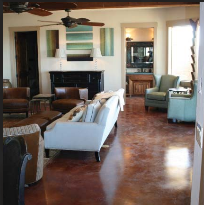
Description: Color: Vintage Umber