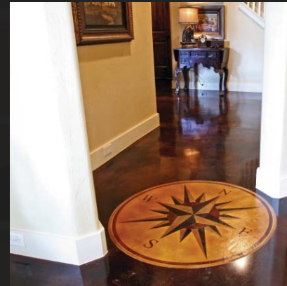
Description: Color: Vintage Umber