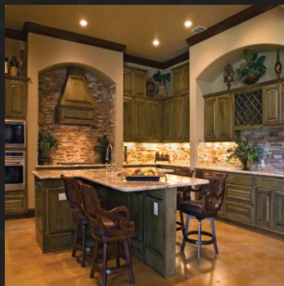
Description: Color: Cola