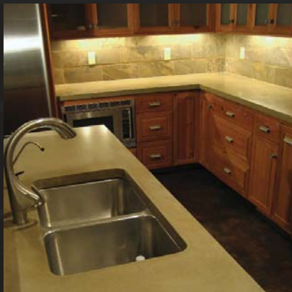
Precast Concrete Counters