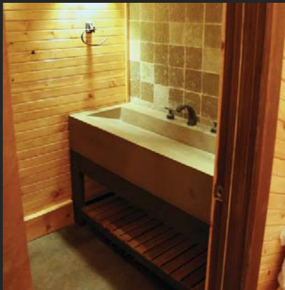
Precast Concrete Sinks