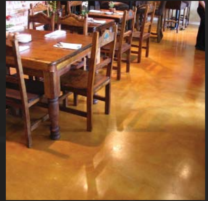
Interior Commercial Stained and Sealed Concrete Flooring