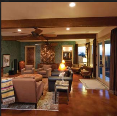
Description: Color: Cocoa