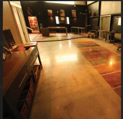
Showroom by Appointment