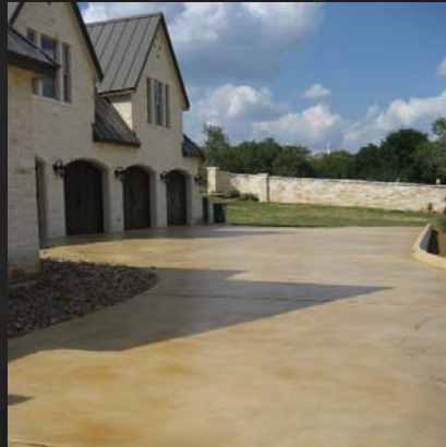
Exterior Stained and Sealed Concrete