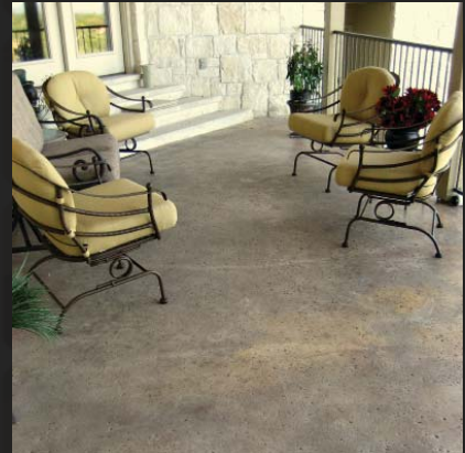
Description: Color: Mahogany Texture: Salt Rock