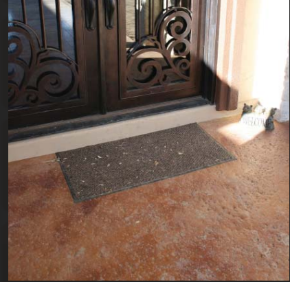
Description: Color: Cola Texture: Salt Rock