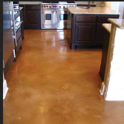
Description: Color: Cola