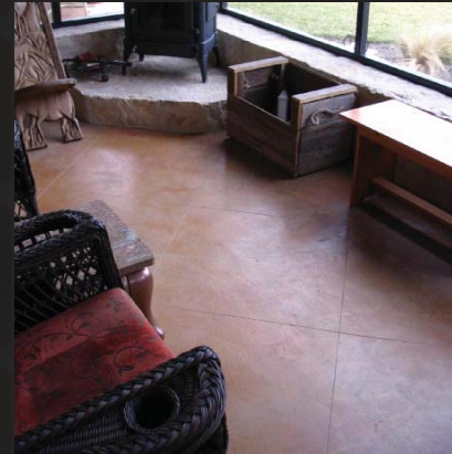
Description: Color: Malay Tan Texture: Troweled