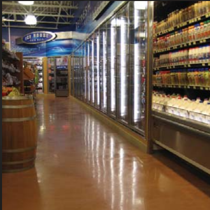
Commercial Polished Concrete Flooring