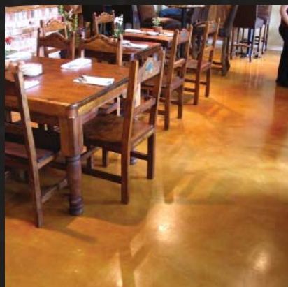
Description: Color: Maylay Tan