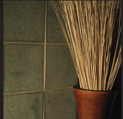
Slick Rock Tiles