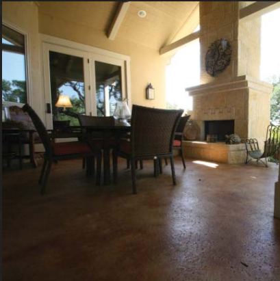
Description: Color: Vintage Umber Texture: Salt Rock