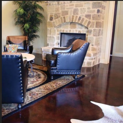
Description: Color: Vintage Umber