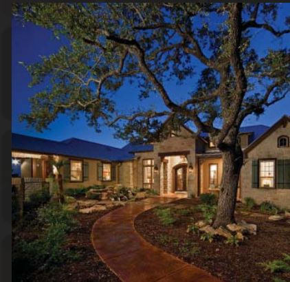
Description: Color: Cola Texture: Salt Rock